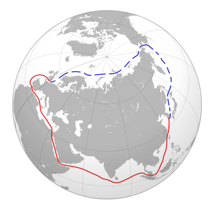
Figure 2 The Northern Sea Route and the Suez Canal Route [8]

Liu and Kronbak [7] presented a case study which examined the economic viability of shipping from Rotterdam to Yokohama via the Northern Sea Route versus the conventional Suez Canal route as shown in Figure 2 [8]. They compared two basic scenarios to determine which was more economically viable – Option A: Buying a regular 4300 TEU vessel and shipping year round through the Suez Canal; Option B: Buying an ice class 4300 TEU to be used in the NSR during the months the NSR is navigable and which would be used for the Suez Canal route the rest of the year. The idea is that due to the significantly shorter distance though the NSR, option B trips will, on average, require significantly less time than the option A trips, thus allowing for more trips annually and generating more annual revenue using option B. Whether it is more profitable is another question.